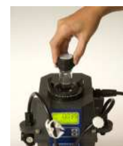
*figure 2 Easy Calibration