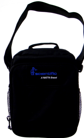
27035 Carrying Case