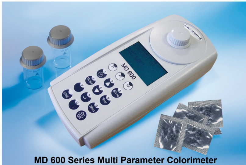
MD 600 Series Multi Parameter Colorimeter

Lovibond Spectrophotometers and Colorimeters offer high quality measurement, ease of use and lower cost reagents. Manufactured in Germany but distributed and serviced from Sarasota, FL. Many popular reagents are manufactured in Sarasota. Lovibond offers the best option for colorimetric measurement for water and wastewater. Contact our office for specific pricing and reagent choices. Pricing is ALWAYS lower than the traditional choice for photometric measurement. Florida shipping by UPS ground is next day delivery for stock items.